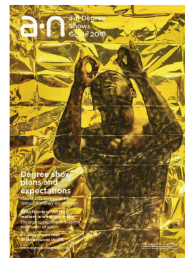
a-n Degree Shows Guide 2018

Focused on encouraging visits, the guide will highlight the UK's most innovative fine and applied arts courses, present new talent and help collectors find something they love at an affordable price. With insights from across the sector into how to support up-and-coming artists.