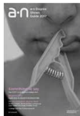
a-n Degree Shows Guide 2017

Focused on encouraging visits, the guide will highlight the UK's most innovative fine and applied arts courses, present new talent and help collectors find something they love at an affordable price. With insights from across the sector into how to support up-and-coming artists.