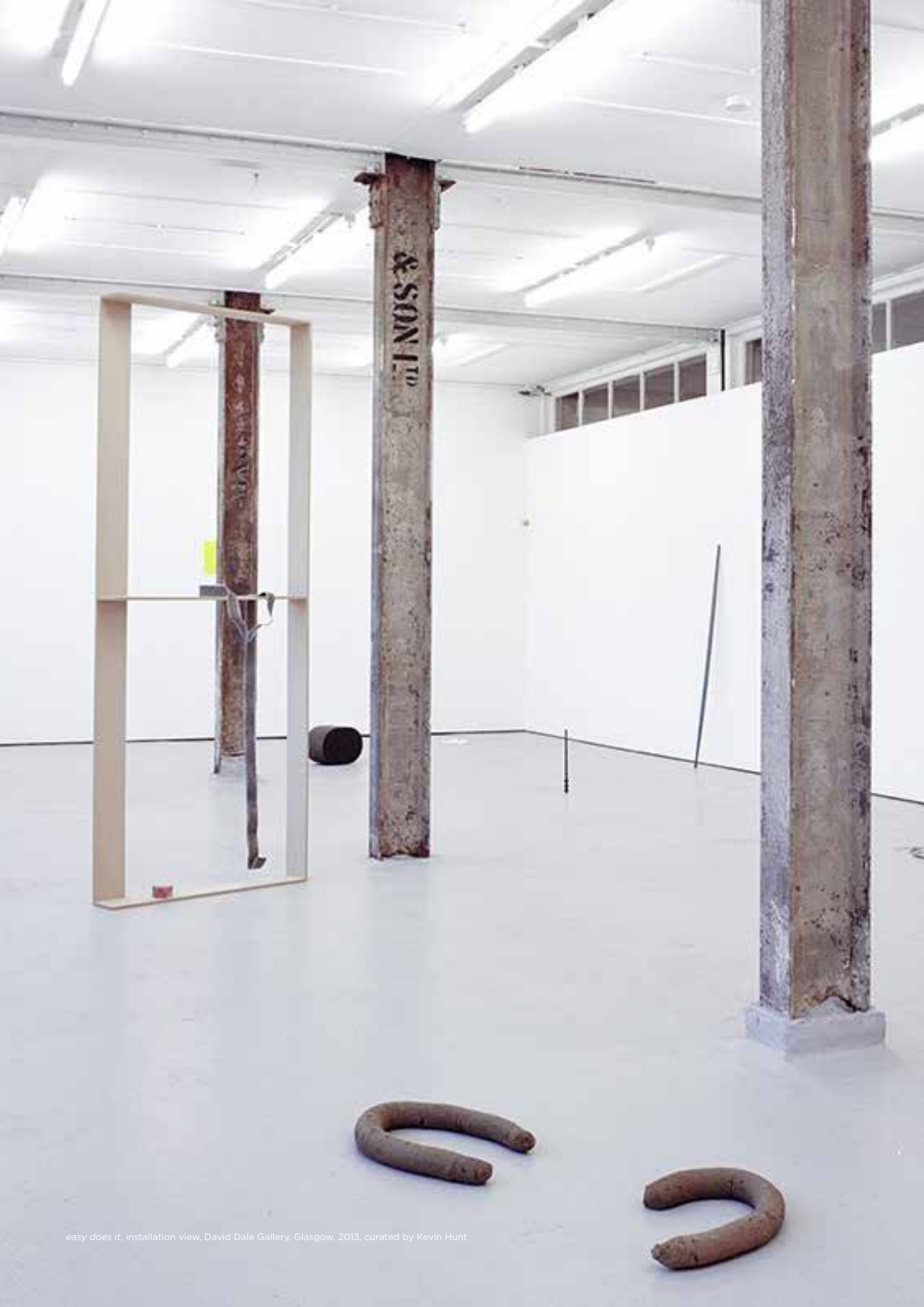
easy does it , installation view, David Dale Gallery, Glasgow, 2013, curated by Kevin Hunt