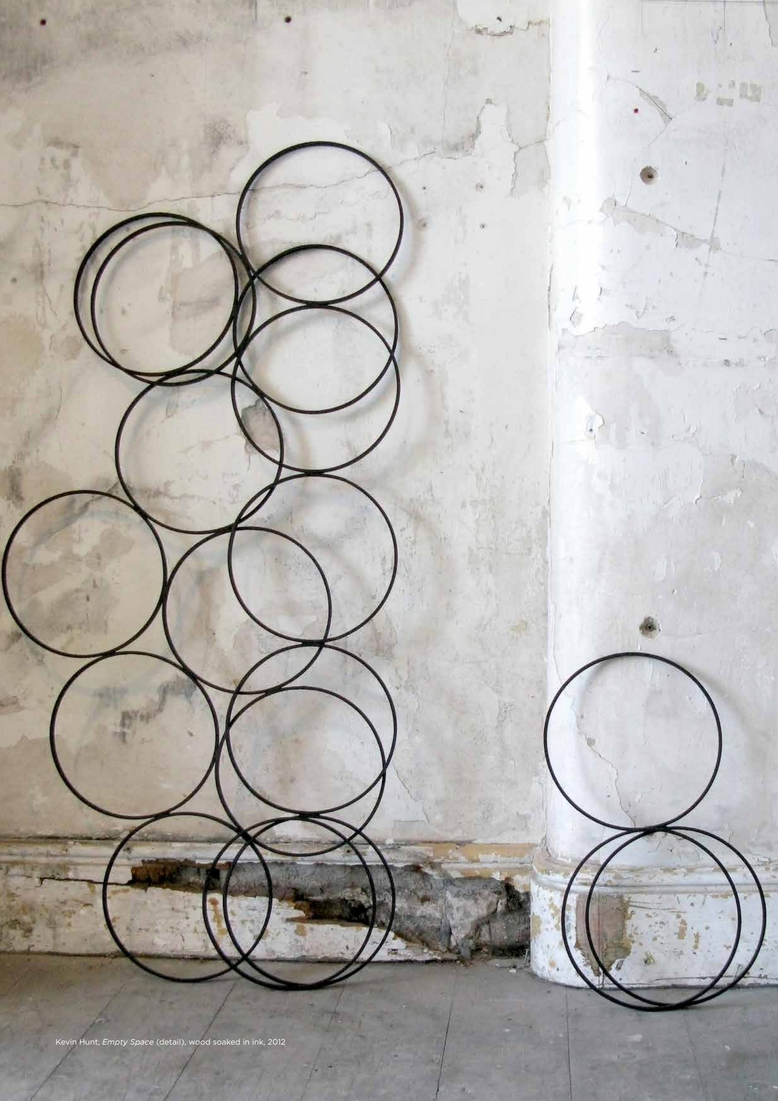
Kevin Hunt, Empty Space (detail), wood soaked in ink, 2012